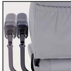
Width adjustable armrest