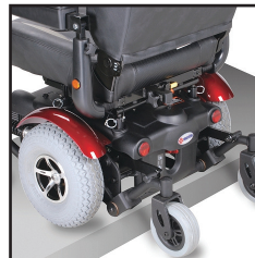
6" caster on front & rear for maximum stability