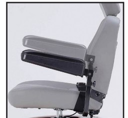
Height adjustable armrest