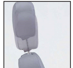
Height adjustable headrest