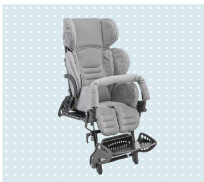
• Kimba seating unit