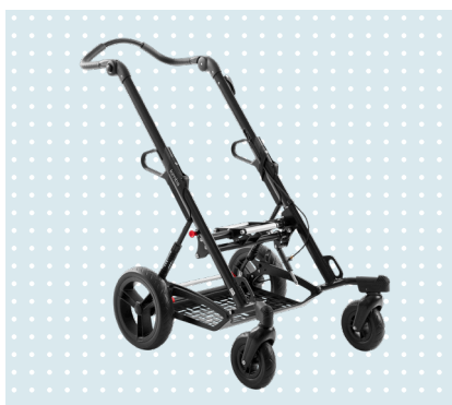
• Kimba outdoor mobility base