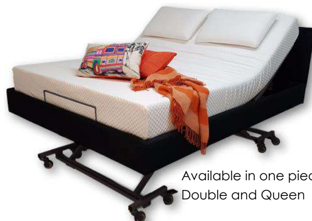
Available in one piece Double and Queen