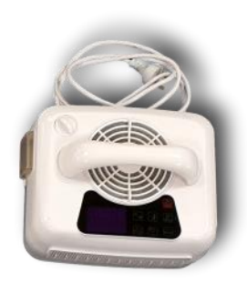
HydroSense whisper quiet motor.