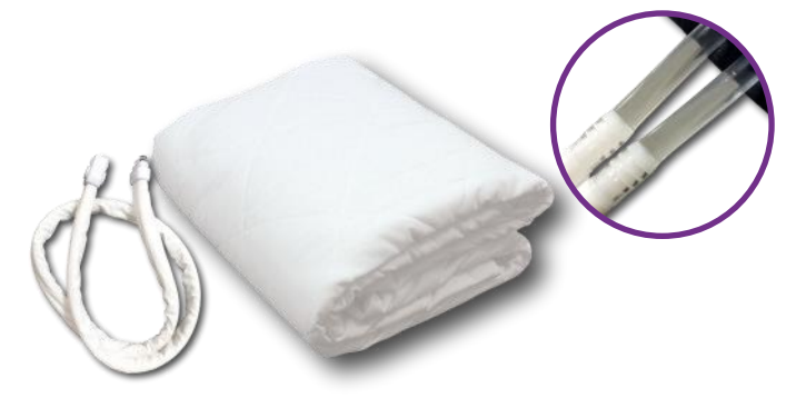
HydroSense Bed Pad with silicone medical grade tubing. Available in one size: Single 190 x 90cm. Code: PPSMP