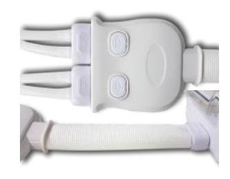
HydroSense Double Adaptor Kit