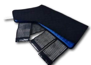
HydroSense Foot and Leg Cuff