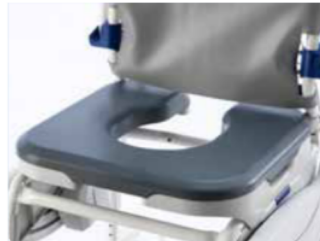
Variable soft seat Hygiene cut out can be positioned in all 4 directions.