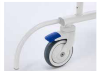
Front and rear anti-tippers For additional safety.