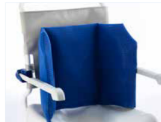
Soft backrest cushion For additional stability and comfort. Will also benefit smaller users and young adults.