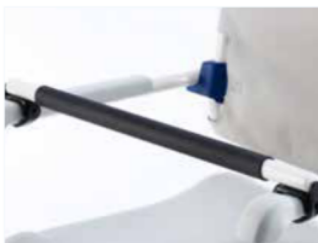
Safety bar For additional safety and reassurance.