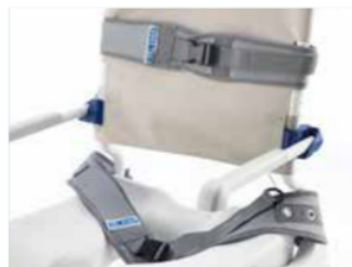
Safety belts Ocean For safe positioning. Individually adjustable, high load capacity and easy to assemble. Machine washable.