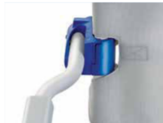
Wider XL armrests Increases the distance between the armrests by 40 mm on each side.