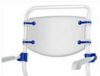
Solid plastic backrest Offers a stable upright position and is easy to clean.