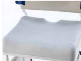
Universal soft seat Comfortable, closed seat surface.