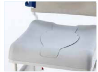
Small soft seat insert Can be used with the small soft seat when the commode function is not required.