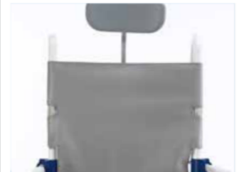
Comfort backrest For additional comfort and easy cleaning.