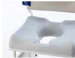
Small soft seat With small, oval opening for smaller and young adults.