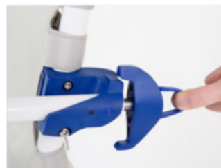
Armrest lock Locks armrest into the lower or higher position.