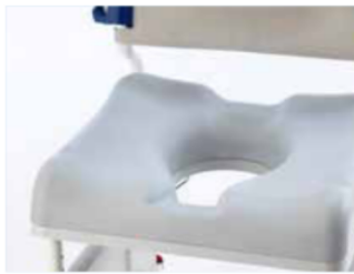
Standard soft seat With key shaped cut out.