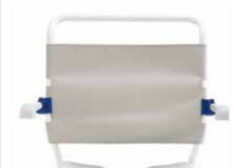
XL back Increases the width between the armrests by 80mm. Can be retrofitted to standard Ocean Ergo models.