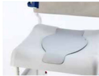
Soft seat insert Can be used with or without the soft seat when commode function is not required.