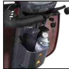
Extra storage & Shopping bag hook.