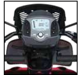
Digital LCD Dashboard Display.