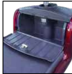
Lockable storage drawer underneath the seat.