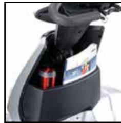
More space for storage