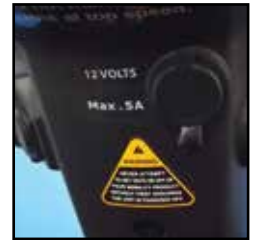
Handy 12 volt socket

Overall Dimension : A x B x C 130 x 69 x 125cm/51 x 27 x 49"