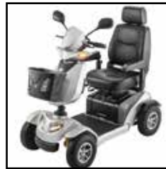
Modern LED lighting system