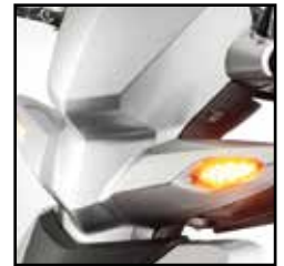
Modern LED lighting system