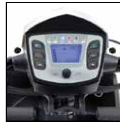
Digital LCD dashboard display