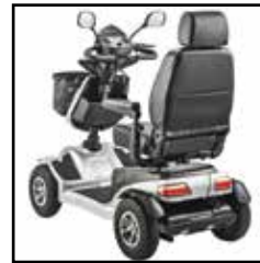
Modern LED lighting system