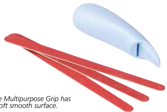
The Multipurpose Grip has a soft smooth surface.

Beauty Multipurpose grip rests securely in the whole hand and offers a variety of use. With a poor hand function it can be very difficult to use a nail file. By inserting a nail file into the narrow end, a pedicure can be done with ease. The wider end of the grip may be used for a tooth brush or shaver.