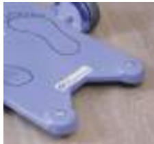
BASE RECESS ALLOWS GOOD TOILET ACCESS