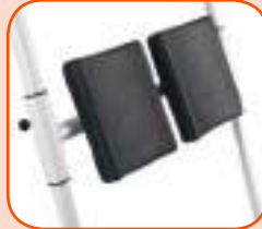
ADJUSTABLE KNEE PAD HEIGHT AND ANGLE

The knee pads are height adjustable between 345mm - 515mm to suit a range of patient sizes. They can be independently tilted and/or re-positioned horizontally. Optional padded covers provide additional comfort.