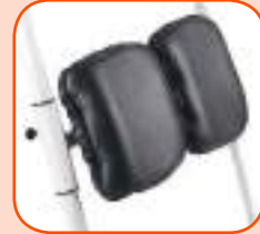
OPTIONAL KNEE PAD CUSHIONS FOR COMFORT