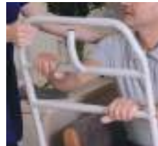
MULTI HAND-HOLD POINTS FOR COMFORT