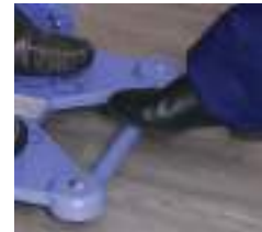
FOOT SUPPORT BAR/ CARRY HANDLE