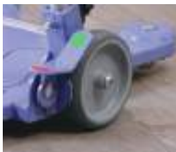
INDEPENDENTLY BRAKED CENTRAL WHEELS