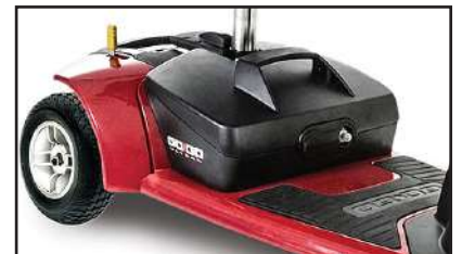
Drop-in Battery Box