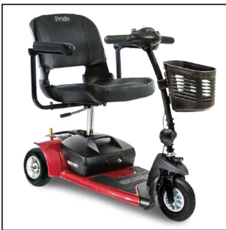
Go-Go ® Ultra X 3-Wheel

With feather-touch disassembly and a drop-in battery box, the Go-Go ® Ultra X is an exceptional value for life on the go. With a 118 kg (260 lb.) weight capacity and a maximum speed up to 6.4 km/h (4 mph), the Go-Go Ultra X is designed to impress. Available in three or four-wheels.