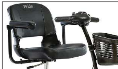
Comfortable Swivel Seat

With feather-touch disassembly and a drop-in battery box, the Go-Go ® Ultra X is an exceptional value for life on the go. With a 118 kg (260 lb.) weight capacity and a maximum speed up to 6.4 km/h (4 mph), the Go-Go Ultra X is designed to impress. Available in three or four-wheels.