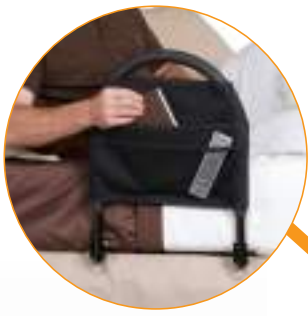
Includes Organizer Pouch