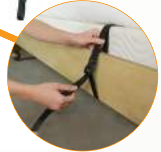
Safety Strap Holds the Rail in Place