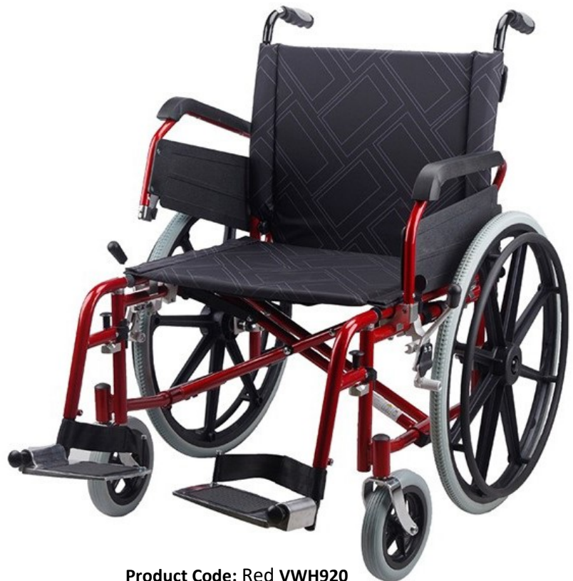
Product Code: Red VWH920