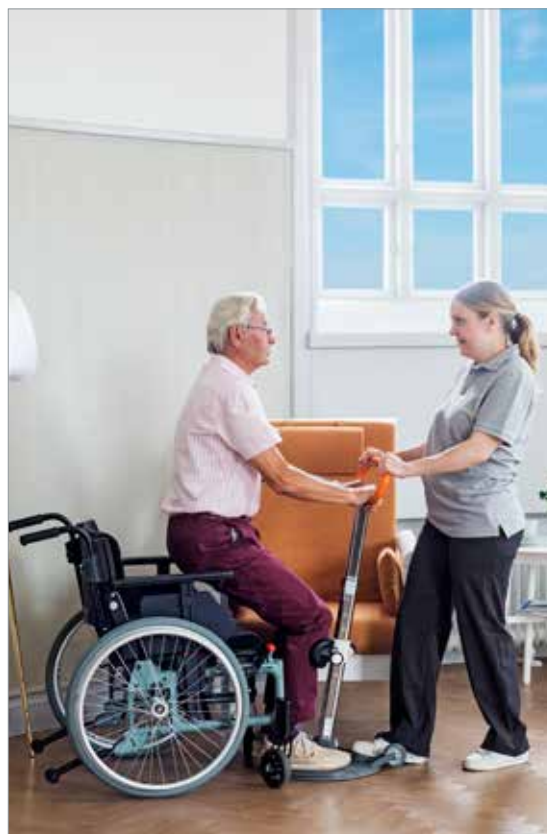
A safe transfer which allows eye contact and good communication.

The Turner PRO works well on different flooring materials including carpets.