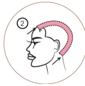
Front to nape