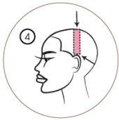
Ear to ear over top