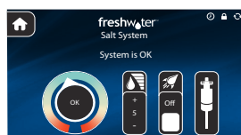
Touch Screen Display

Using a FreshWater 5-Way Test Strip, check the water to ensure a residual chlorine level of a minimum of 3 ppm has been maintained over the past 24 hours. If the chlorine level has dropped below 3 ppm, repeat the chlorination process to achieve 5 ppm and press the Boost button. Check the chlorine level again in 24 hours, and continue the chlorination and Boost process each day until the salt system can independently maintain the target 3 ppm chlorine residual. Over the next few days, continue to test your water using a FreshWater 5-Way Test Strip and adjust the salt system output level as needed.