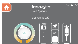
Touch Screen Display