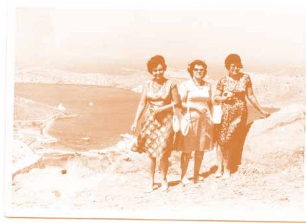
My grandmother on the far right with her two sisters. Ios Island 1964