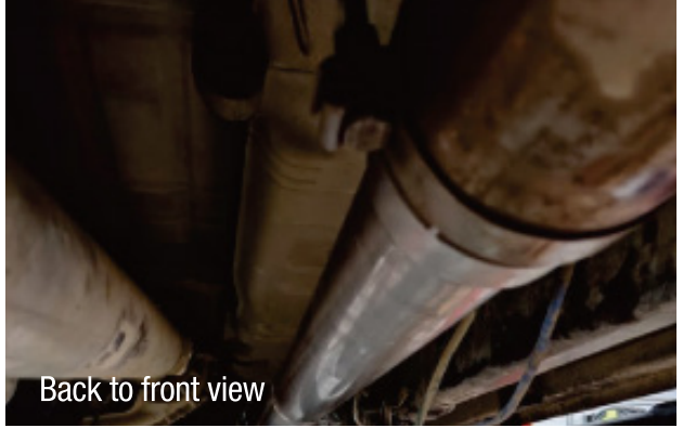
Back to front view