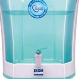
KENT ULTRA STORAGE Double Purification UV+UF With Purified Water Storage Tank