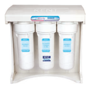
KENT ELITE + Online Purification for Water Coolers