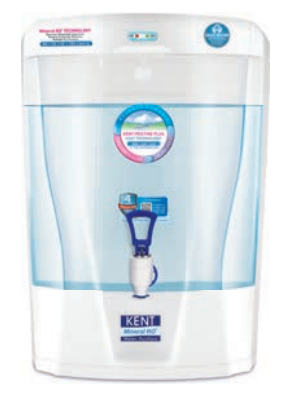
KENT SUPREME EXTRA

RO Water Purifier With Detachable Transparent Storage Tank