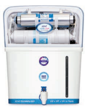
KENT ULTRA STAR Next-Gen UV Purifier With UV Disinfection in Storage Tank