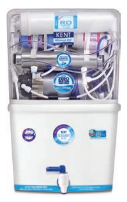
KENT SUPER STAR RO Water Purifier With RO+UV+UF+TDS Control

RO Water Purifier With UV Disinfection in Storage Tank