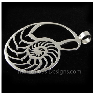
Ammonite Cut out Pendant