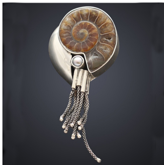
Ammonite Alive Pendant