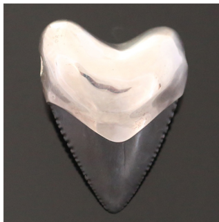
Shark Tooth Pendant