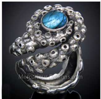
Tentacle Stoned Ring