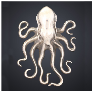
Large Octopus Pendant