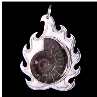
Ammonite Flame Pendant