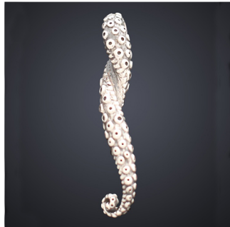
Large Tentacle Pendant