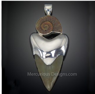
Shark Tooth Ammonite Pendant