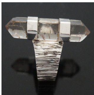
Quartz Point Ring