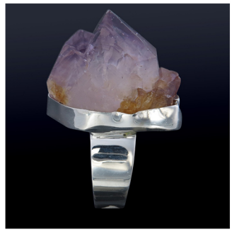
Spirit Quartz Ring

The Meta collection by Mercurious Designs connects us with magical timeless symbols, designed with intention to act as amulets, talismans of power and protection as much as for unique adornment.