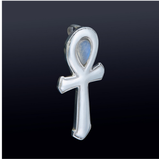
Stoned Ankh Pendant