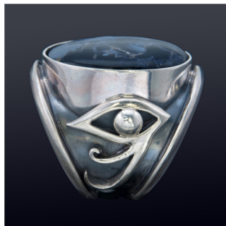
Eye of Horus Ring