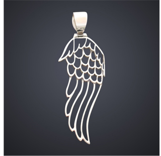
Angel Wing Pendant