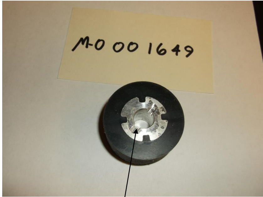
Slot for pin