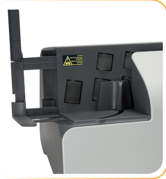
Easy-to-use support arm extends to hold large envelopes