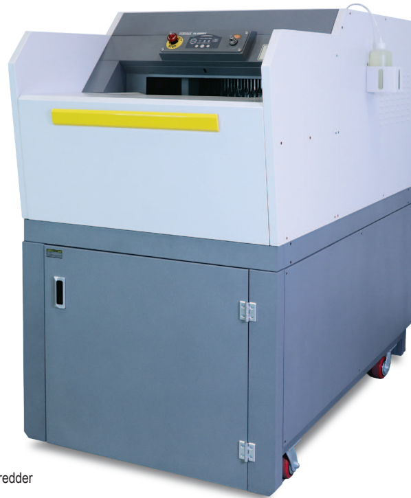
FD 8906CC Industrial Shredder