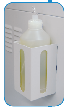
AutoOiler - Automatically pumps oil onto cutting blades