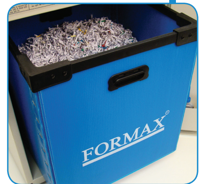
Lifetime Guaranteed Heavy-Duty Waste Bin

WWW.WHITAKERBROTHERS.COM 3 TAFT COURT ROCKVILLE, MD 20850 800-243-9226