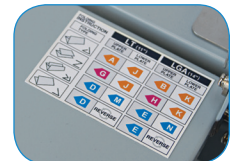
Clearly marked fold guide for quick and easy setup

The FD 300 Office Desktop Folder provides an economical solution for low-volume folding projects. This compact folder processes 11" and 14" paper at speeds up to 7,400 sheets per hour, and is clearly marked for 4 common fold settings.