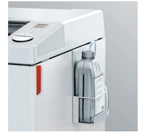
AUTOMATIC OIL INJECTION

Patented Electronic Capacity Control (ECC) indicator monitors sheet capacity levels during operation to prevent jams.