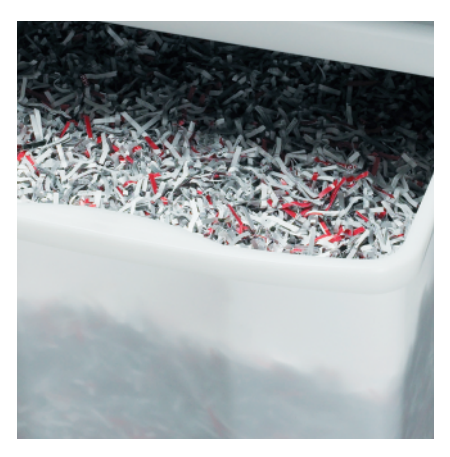
ENVIRONMENTALLY FRIENDLY BIN

On CD capable models, the electronically controlled shield protects the operator from stray splinters of plastic.