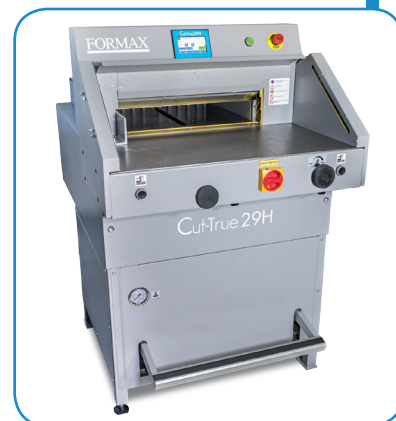
Standard model, without side tables