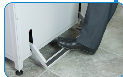
Foot pedal pre-clamp holds paper to check alignment prior to cutting