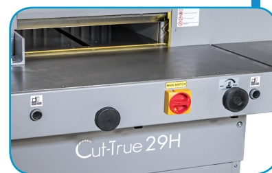
Two-button operation, fine-tune knob, adjustable hydraulic pressure