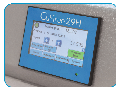
Touchscreen control panel allows for programming up to 100 jobs

* 31"W with safety curtains removed for easier transport through doorways. 33.5"W including safety curtains.