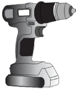
Power Tool 1/4 drill bit