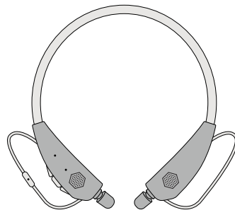
Procomm2 Bluetooth Earbuds