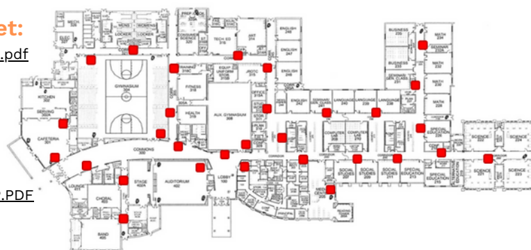
■ Emergency Response Shield location

https://www.cisa.gov/sites/default/files/2022-11/Mass%20Gatherings%20-%20Security%20Awareness%20for%20ST-CP.PDF