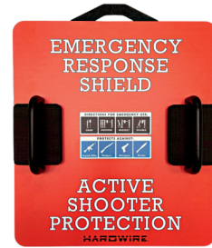
HANDLE SIDE FACES OUT