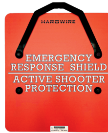
FLAT SIDE FACES WALL

Stops shotguns, handguns, rifles, and Green Tip armor piercing ammunition.