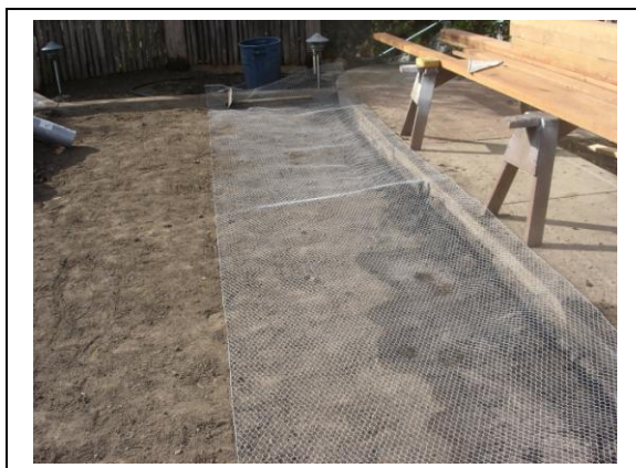
Rolling out wire