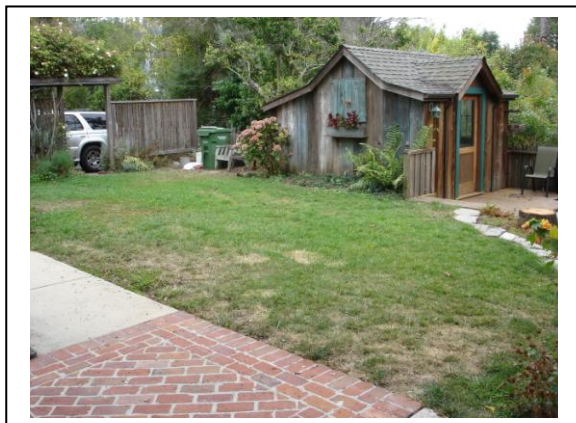
A lawn over run by gophers