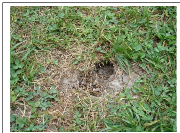
Gopher hole in lawn