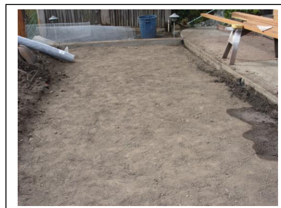
Soil removed, compacted and smoothed