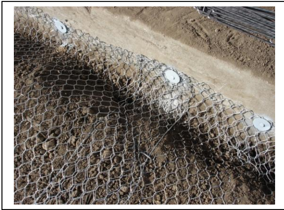
Wire secured to concrete edge