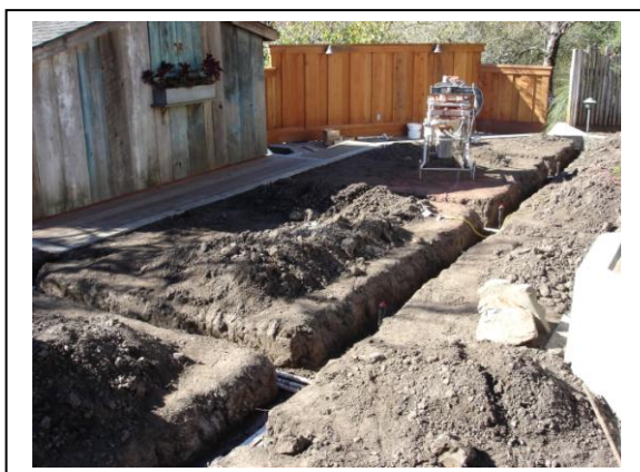
Old sod removed new irrigation being installed