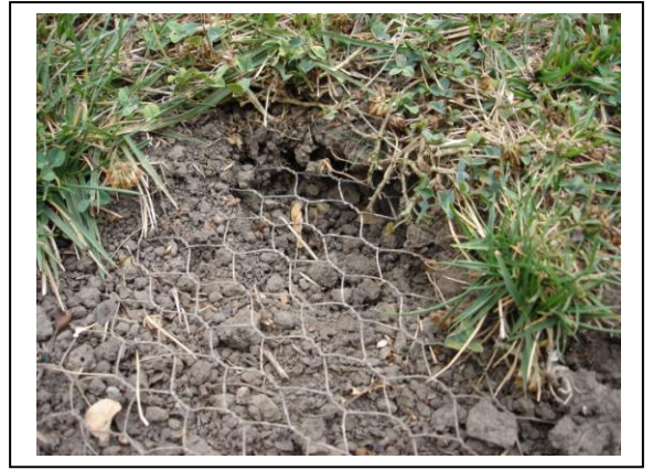
If you don't do it right this is what happens