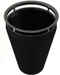
Replaceable Sediment Bag

Lift Handles ease installation and maintenance