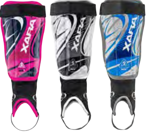
See page 38 for Shinguard Sizing Guide

WHITE/BLACK - SILVER/BLUE/WHITE - NAVY/PINK/WHITE