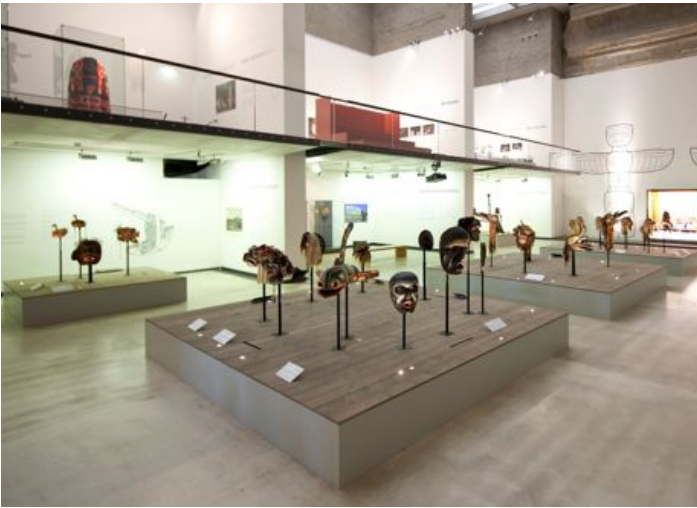
A portion of the Potlatch Collection on display in Dresden for "Die Macht des Schenkens".