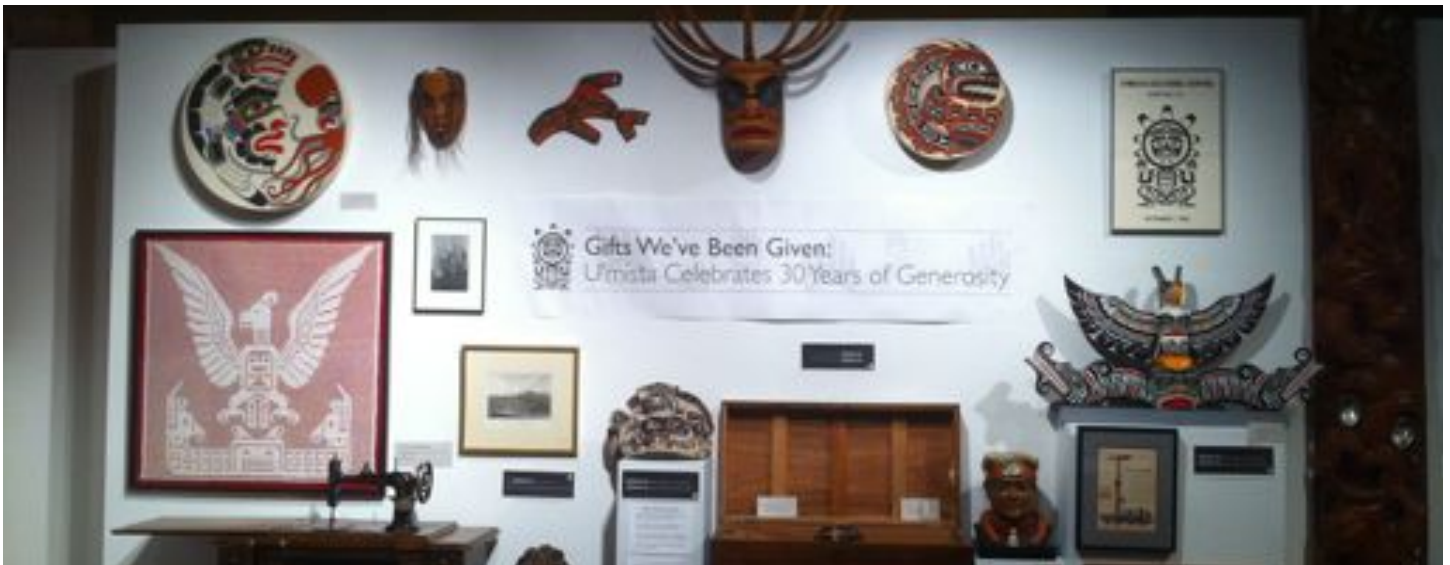
“Gifts We’ve Been Given,” 30th anniversary exhibit on display at U’mistá until November 2011.