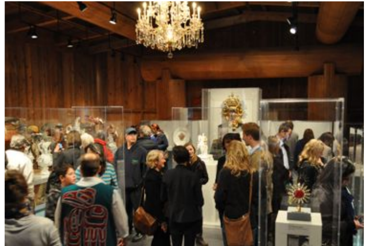
Opening day in Alert Bay. The Power of Giving. On display at U'mista until the 28th of August 2011