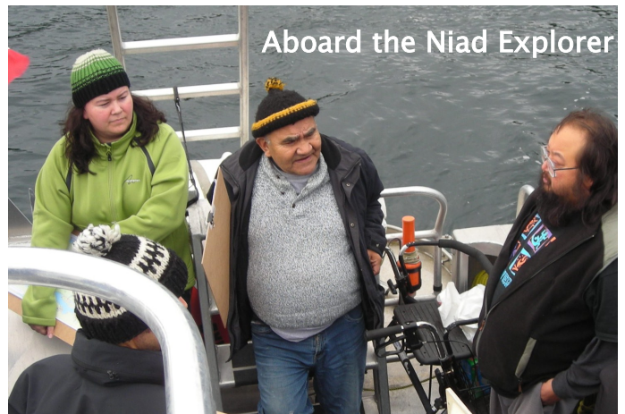
Aboard the Naiad Explorer

season, well before the cold winter would set in. Lunch served on the Naiad, was a good old fashioned clam chowder with salmon rolls with butter. Yum!