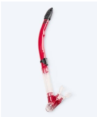
1002136 – Red