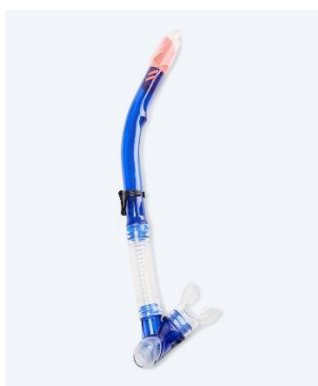
1002135 - Blå