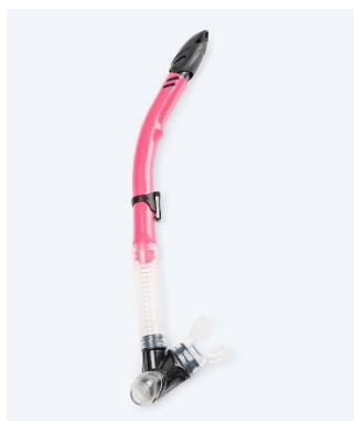
1002137 - Lyserød

Produkt navn: Hudson full dry snorkel til voksne Model No.: 1002133, 1002134, 1002135, 1002136, 1002137, 1002138, 1002139 (hvid) Produkttype: Dykkersnorkel Identifikation: