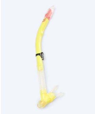
1002134 – Yellow