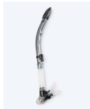
1002138 - Grå

Er i overensstemmelse med bestemmelserne i Europa-Parlamentets og Rådets forordning (EU) 2016/425 af 9. marts 2016 om personlige værnemidler, og overensstemmelse med kravene i ovenstående regulering bekræftes ved fuldstændig overholdelse af følgende tekniske specifikationer: