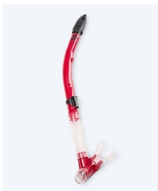
1002136 - Rød