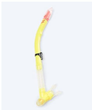
1002134 - Gul