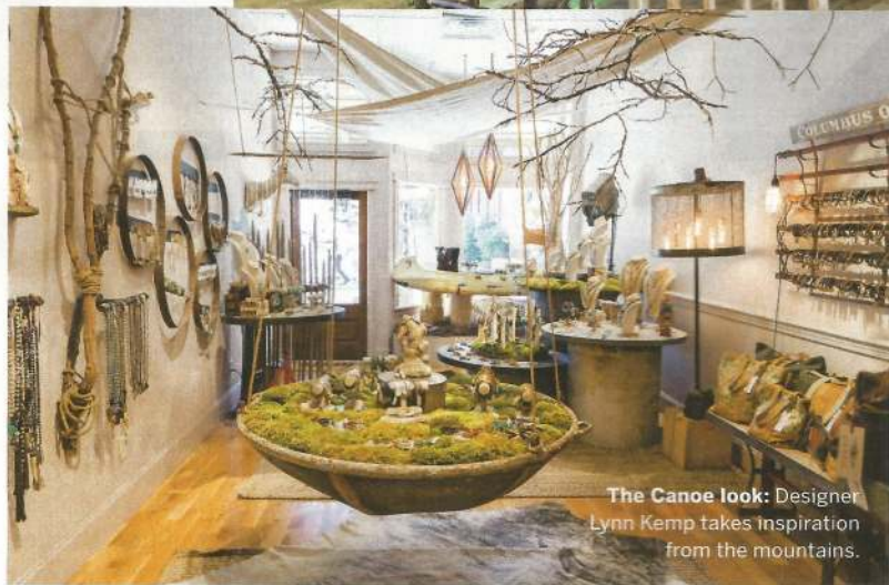
The Canoe look: Designer Lynn Kemp takes inspiration from the mountains.

Whitaker makes a good case for renting a cabin, where you can have all the amenities to yourself. "People have the romantic idea of a house in the mountains, and ours live up to that," she says. "They all either have mountain views or are on the water—the two things that make a cabin special."