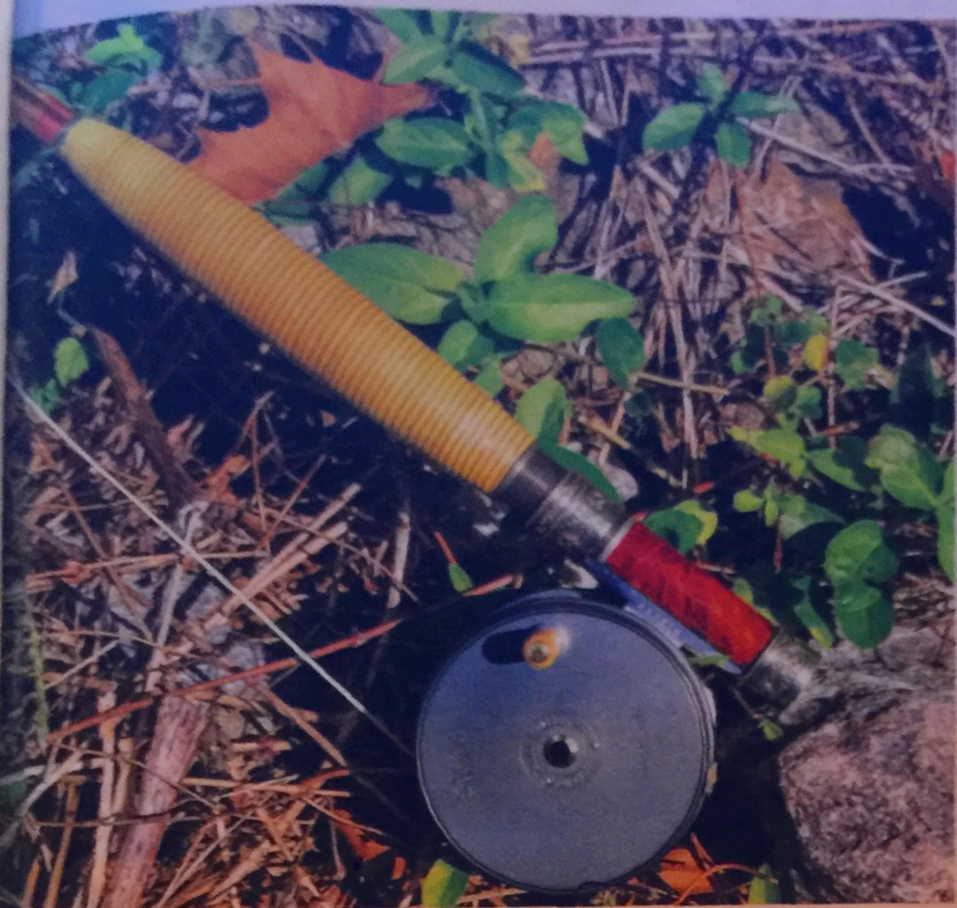
The engraved bamboo rod is a one-of-a-kind.