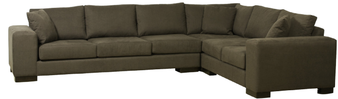
LAF One Arm Sofa, Corner & RAF One Arm Love Seat