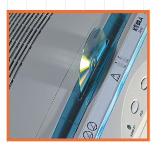
ENERGY SMART SYSTEM with light indicators for power saving stand-by mode.