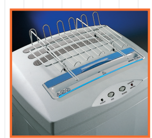
ADJUSTABLE COMPUTER FORMS AND DOCUMENT TOP SHELF, space saving design