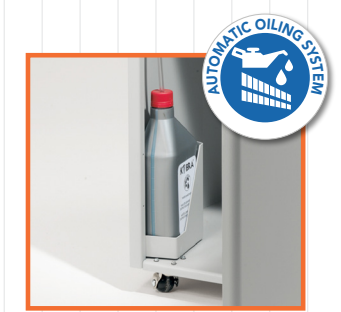
AUTOMATIC INTEGRATED OILING SYSTEM: automatically lubricates the cutting knives during the shredding operation.