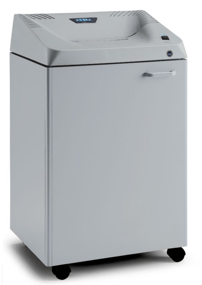
CERTIFICATION MARKS: CB - CSA - CE TRADE AGREEMENT ACT (TAA) COMPLIANT