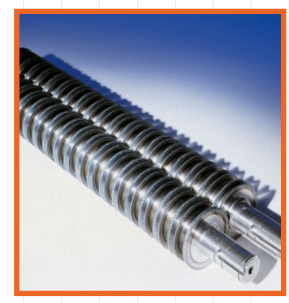
CARBON HARDENED STEEL CUTTING KNIVES unaffected by staples and clips