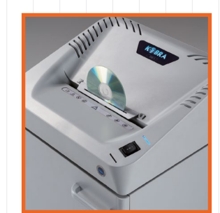
AUTOMATIC START & STOP

Power management system with illuminated indicators for power saving in stand-by mode. Easy to operate On-Off-Reverse switch, with LED signal for bag full and/or open door