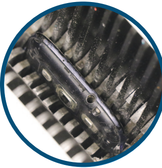
Commercial Grade: Solid-steel heat-treated blades and rugged chain-driven motor