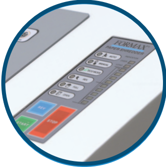
User-Friendly Control Panel: ECO Mode, Door Open Sensor, Reverse, Bin Full Indicator

The Formax FD 87SSD OnSite Multimedia Office Shredder is designed for the modern technological world. It easily shreds mobile phones, SSDs, mini tablets, USBs, and more. The FD 87SSD is whisper-quiet and operates on standard 120V power , making it ideal for the office environment. It features a user-friendly LED control panel , a sturdy all-metal cabinet on casters , solid steel cutting blades , and a rugged chain-driven motor . The separate enclosed infeed options allow users to safely shred a variety of media up to 6.5" wide. With its commercial-grade construction and features, the FD 87SSD sets the standard for safety and security.