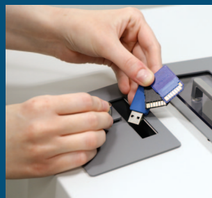
USBs and SD Cards