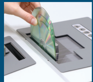
CDs and DVDs