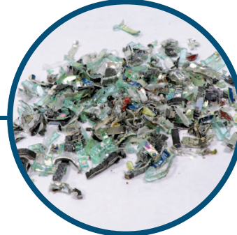
Media Shredding: Shreds media into random pieces up to 0.60". Perfect for security and peace of mind