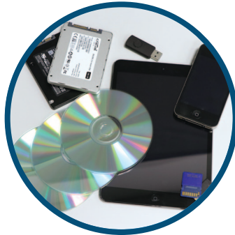
Multimedia Devices: Easily shreds a variety of media from mobile phones to mini tablets