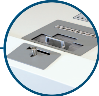
3 Dedicated Infeed Options: Safely feed various size media through the appropriate infeed, up to 6.5" W