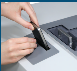
Mobile Phones and SSDs