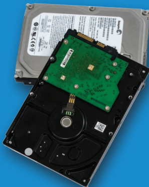
Desktop Hard Drives