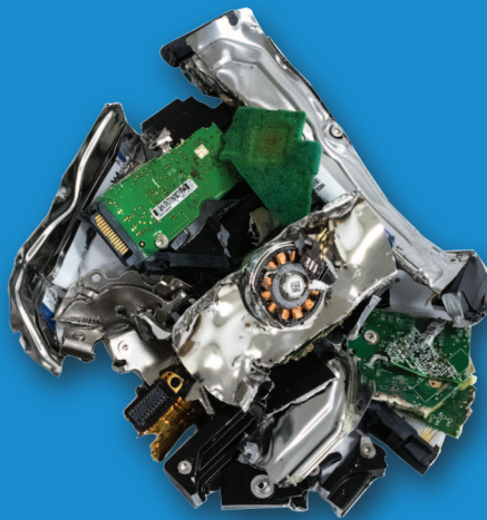
Hard Drives Shredded with the FD 87HDS