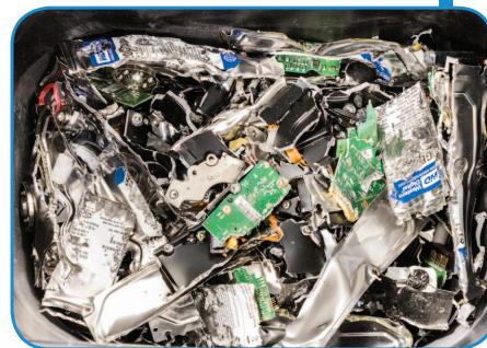
Shredded particles fall into the molded plastic waste bin for easy storage and disposal