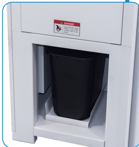
Rugged molded plastic waste bin for convenient storage and disposal