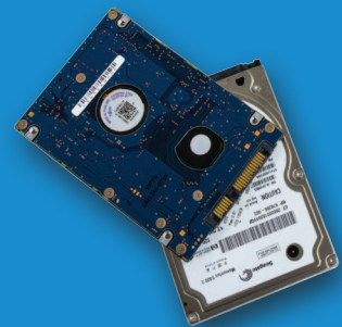
Laptop Hard Drives