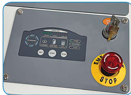
LED control panel, safety key lock and large emergency stop button