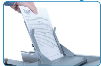
Optional Multi-Sheet Feeder