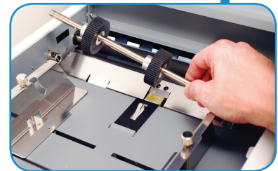
Removable Feed Wheels