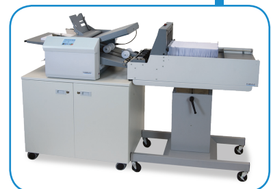
FD 386 in-line with optional V-Stack36i Vertical Stacker, multi-sheet feeder, stand and cabinet

PROGRESSIVE BUSINESS SYSTEMS Optimizing Today's Office Operations 1397 Duncan Lane, Suite D Auburn, GA 30011 Phone: 800-359-0364 Fax: 770-868-0029 www.pbsoffice.com sales@pbsoffice.com