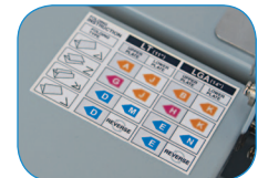
Clearly marked fold guide for quick and easy setup

The FD 300 Office Desktop Folder provides an economical solution for low-volume folding projects. This compact folder processes 11" and 14" paper at speeds up to 7,400 sheets per hour, and is clearly marked for 4 common fold settings.