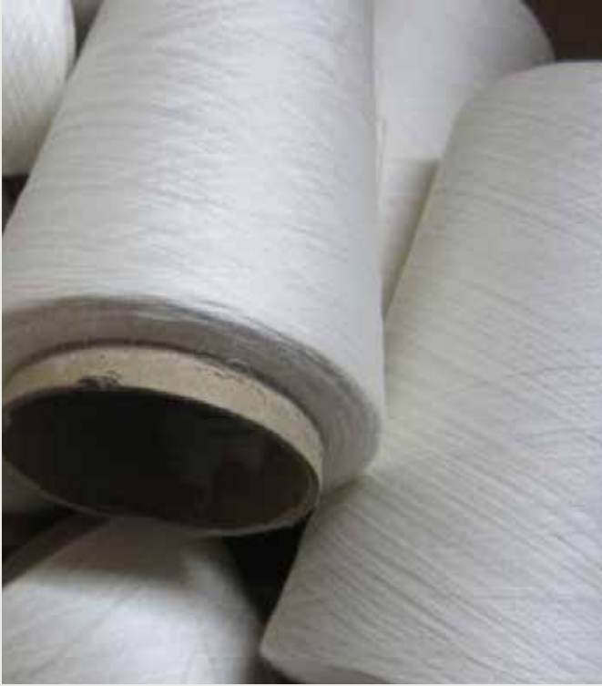
The pure merino wool before it's woven