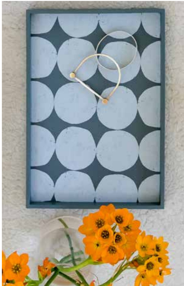
Mini Trays ready to carry your everyday needs!