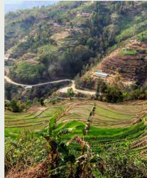
The wonderful shapes of the local landscape

open to the elements, therefore production is weather dependent and care has to be taken to avoid the monsoon season.