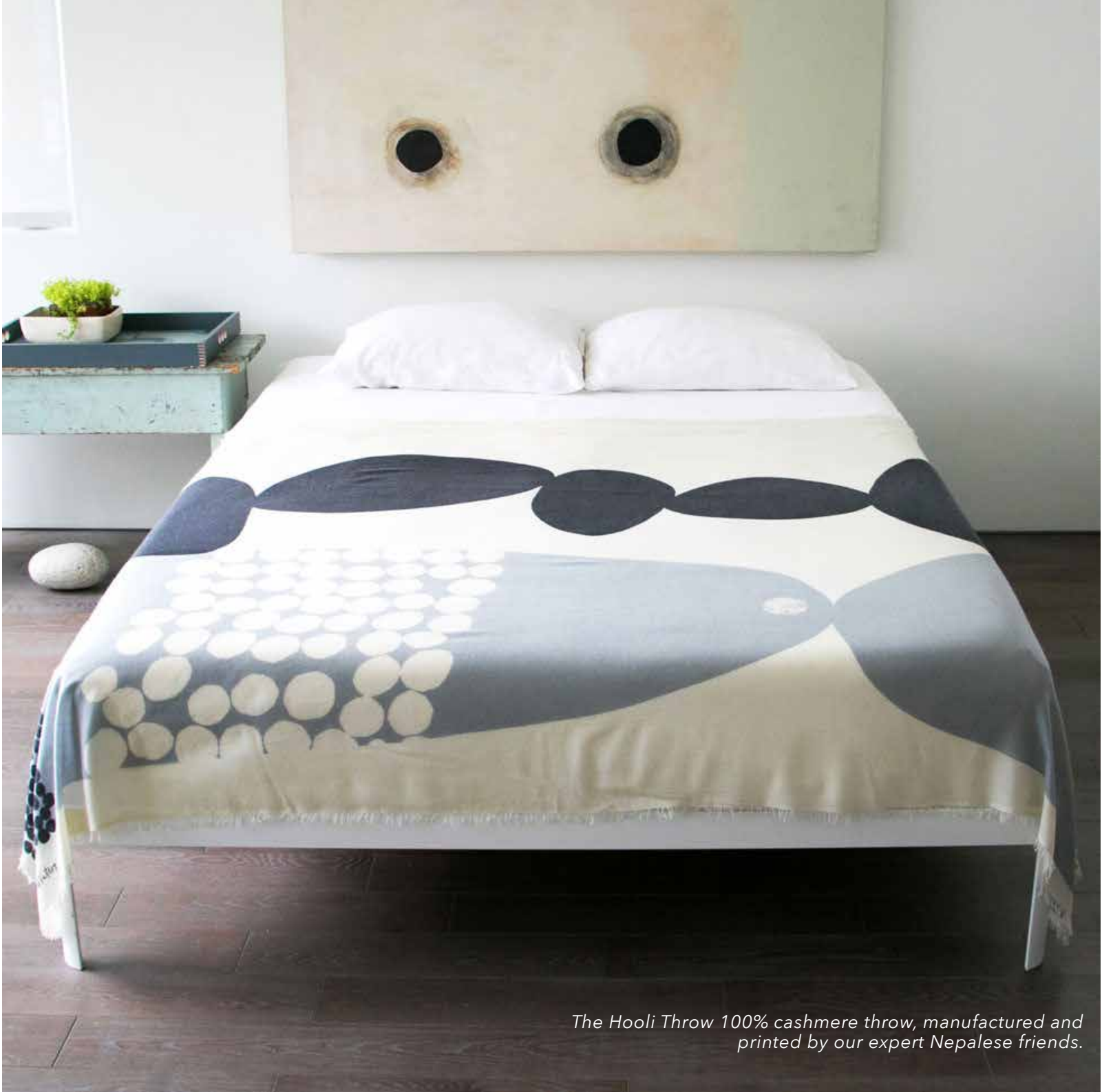
The Hooli Throw 100% cashmere throw, manufactured and printed by our expert Nepalese friends.