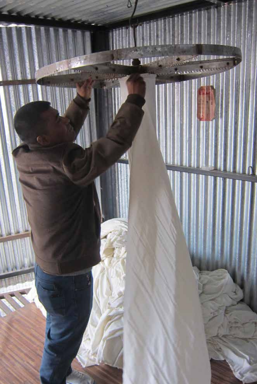
Preparing the fabric for steaming

permitting a critical level of quality control. All of this is done by hand in a traditional weaving process that has been used for thousands of years.