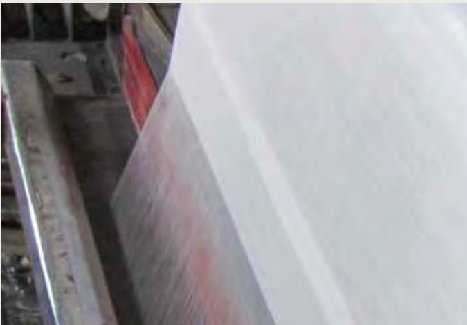
Intricate machinery used to craft our intentionally constructed textiles