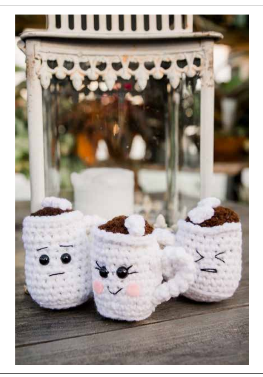
Hot Cocoa Amigurumi