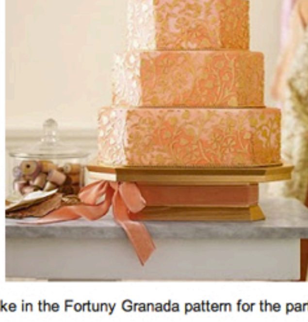
Perhaps a cake in the Fortuny Granada pattern for the party?