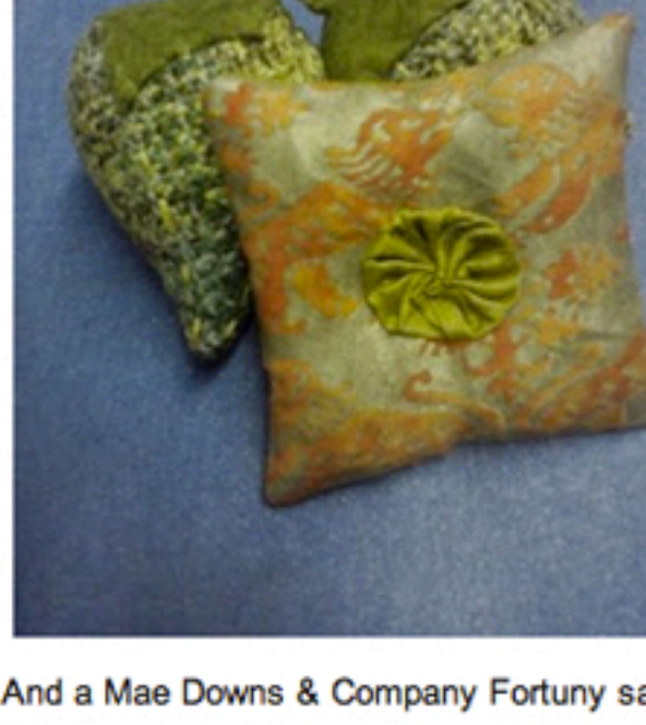
And a Mae Downs & Company Fortuny sachet favor?