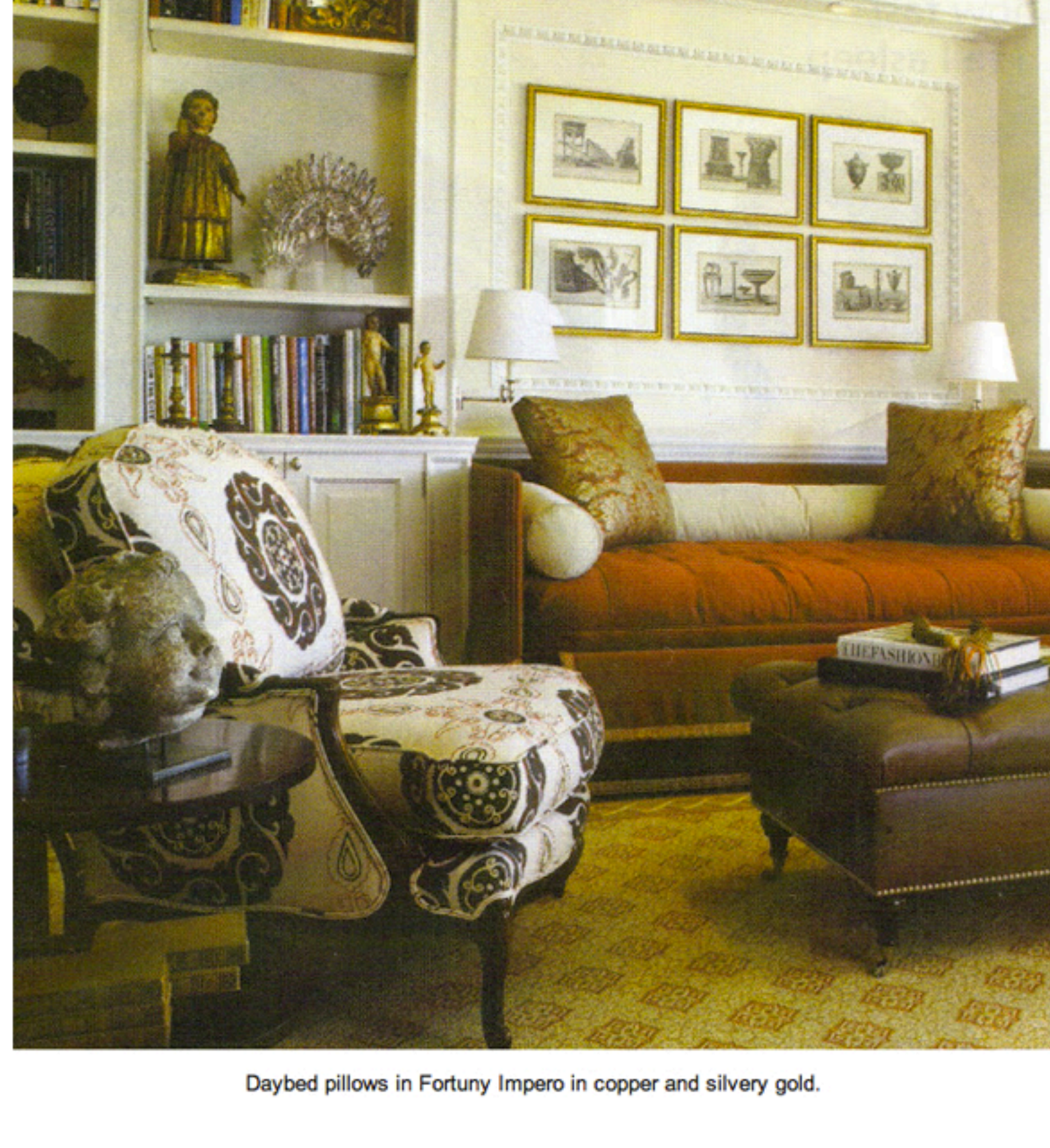
Daybed pillows in Fortuny Impero in copper and silvery gold.