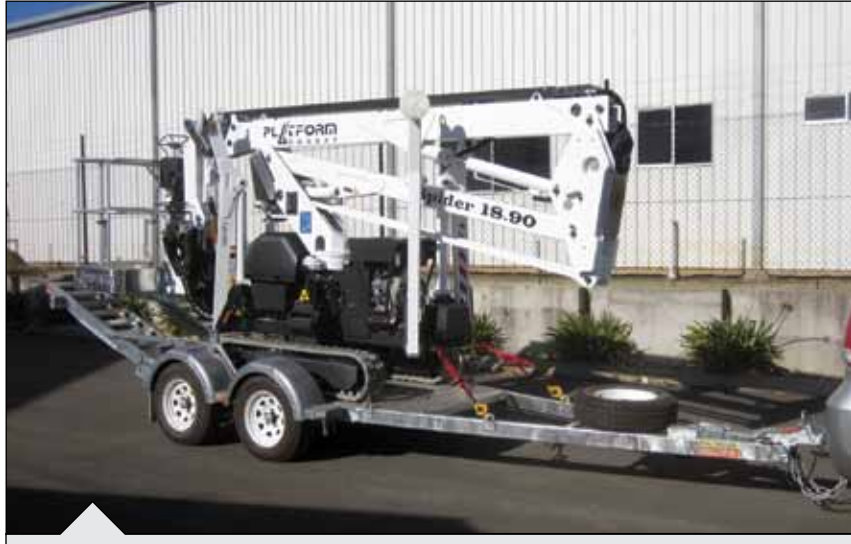
Weighing in at only 2.45 tonnes in weight, the 1890 is very easily transported on its strong gal steel trailer.