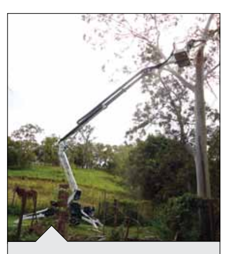
The Arborist's dream machine!