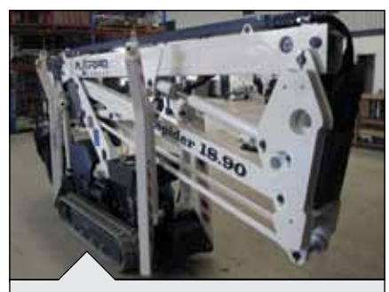
With the tracks retracted, the 18.90 has an incredible stowed dimension of only 792 x 1951 mm which allows it to drive through a domestic doorway!